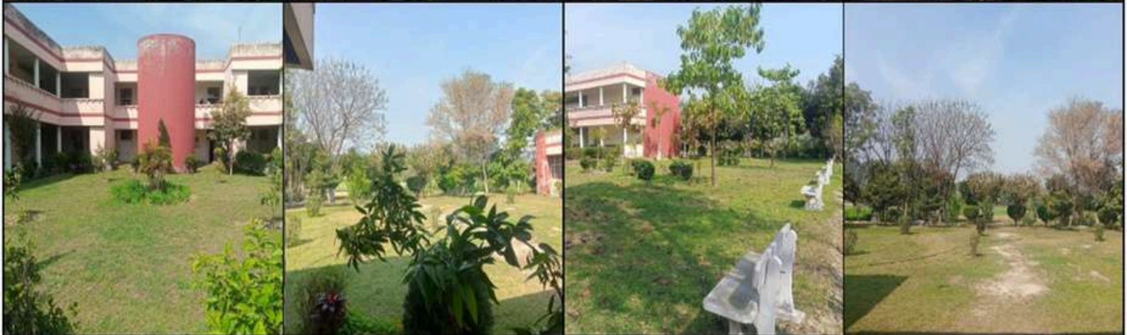
(A Constituent College of Guru Nanak Dev University Amritsar) Bebe Nanaki University College, Mithra